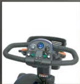
Delta tiller with backlit battery gauge and wraparound handles

The sleek, sporty Colt Plus scooter delivers high performance operation, all-new features and feather-touch disassembly. With a full complement of advanced standard features including back-lit battery gauge, and wraparound delta tiller, the Pride® Colt Plus offers simply the best value for money.