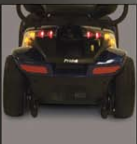
High visibility rear lighting system