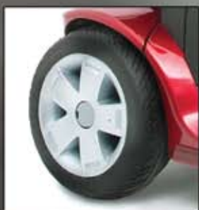
Pride's exclusive stylish, lightweight, non-marking low profile wheels