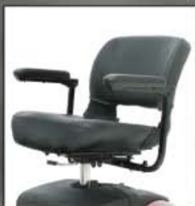
Lightweight adjustable seat with foam inserts