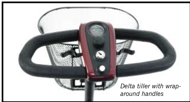
Delta tiller with wrap-around handles

3 sets of exciting colors with every scooter!