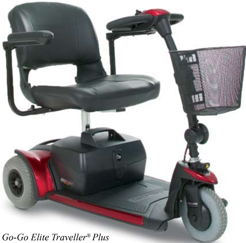
Go-Go Elite Traveller® Plus 3-wheel