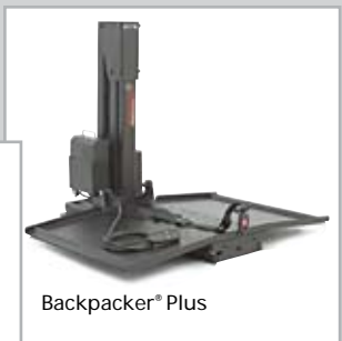
Backpacker ® Plus

These lifts are compatible with the Go-Go Elite Traveller ® Plus