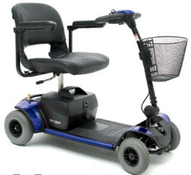
Go-Go Elite Traveller® Plus 4-wheel